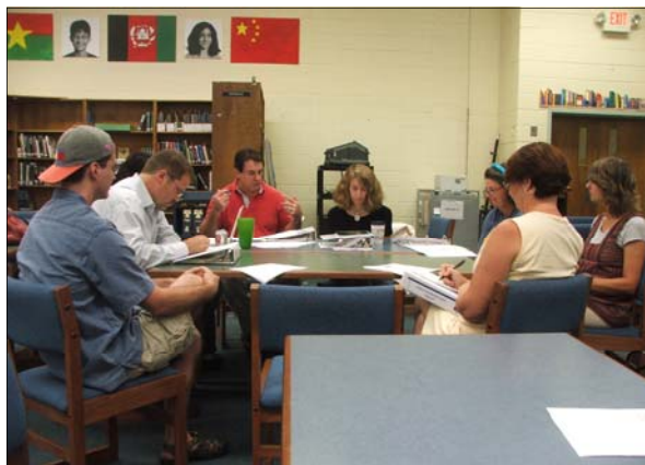
Above: Renfroe Middle School Leadership Team Meeting